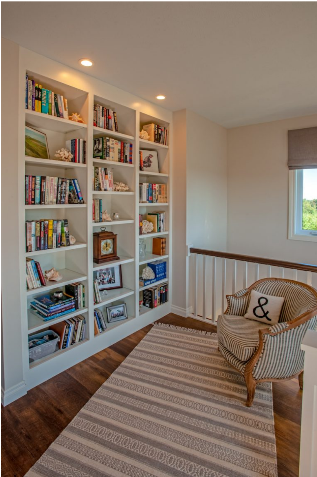
The serene wall colors are the backdrop for the incredible view of dune grass, small-but-resilient trees and seemingly endless water that envelops the home.